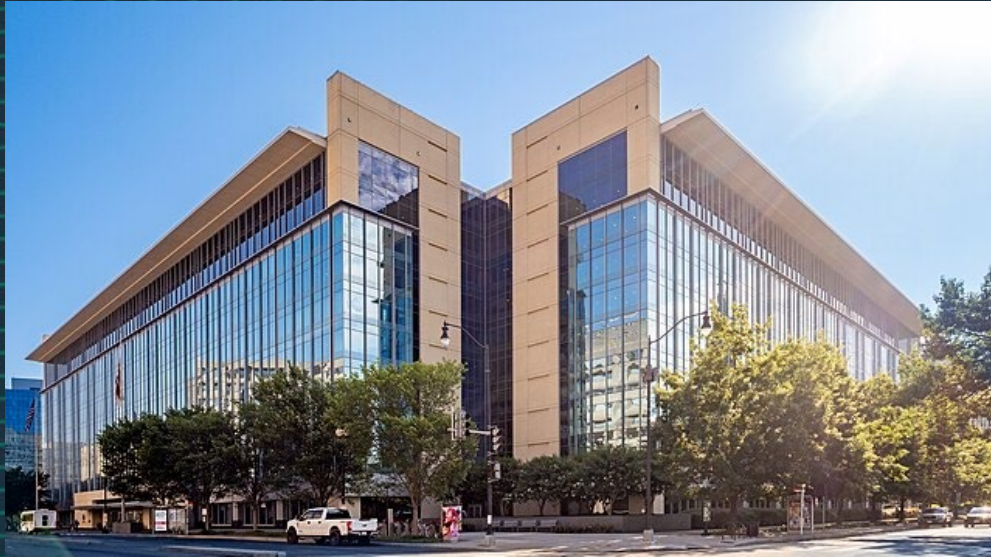
400 7 th St SW, Eight Floor Washington DC 20219