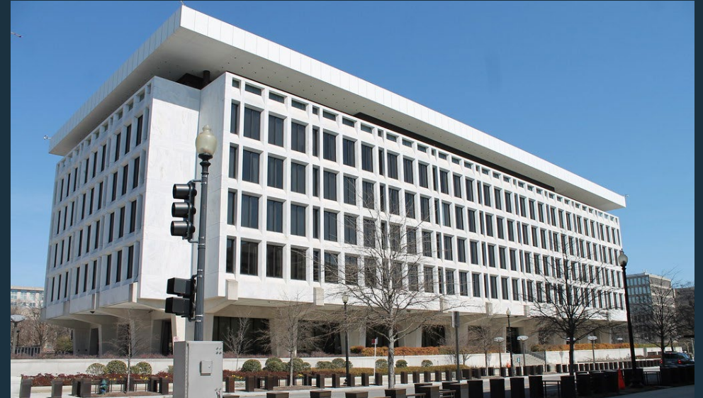
2001 C St NW, Washington, DC Terrace Reception Room