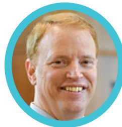
Sen. Tim Knopp D-Bend